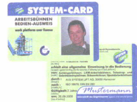
Layout System Card: Until March 2010