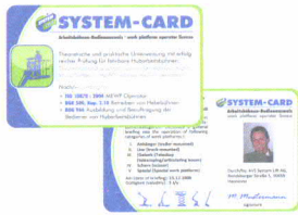
Layout System Card: Since March 2010